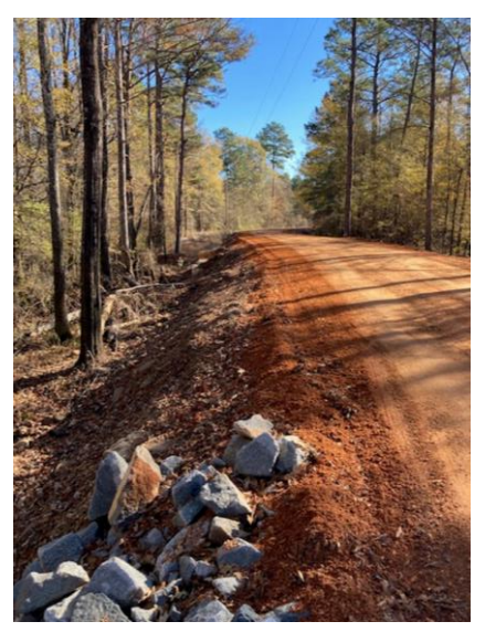
Figure 5: Elevated County Rd 303

This project was initially approved for up to $75,000 initially, but the project ended up utilizing just $54,400 of EPA Federal Funds and matching those funds at a 55% rate. This project ended up being overmatched by $14,750. Labor match totals for the project totaled $19,159 and equipment usage totaled over $70K based upon FEMA costs. The funding breakdown of the project is shown below in Table 1: