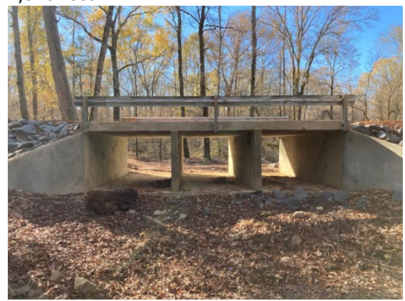
Figure 2: Triple 6x8x23 Box Culvert

Through this project, the Calhoun County Road Department was able to elevate County Road 303, install culverts, add fabric and rip rap to slopes, and install a triple 6'x8'x23' box culvert. The project length was 1,320 feet.