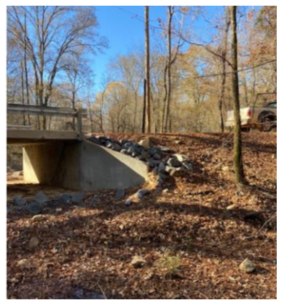
Figure 3: Rip Rap and Fabric on Slopes