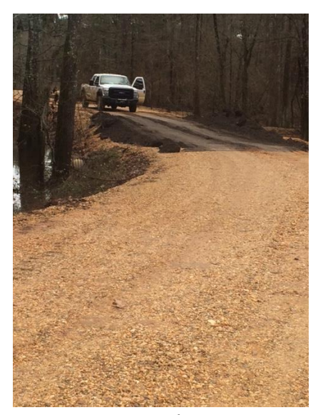
Figure 4: County Rd 303